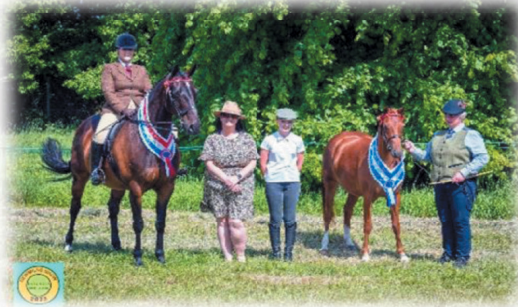
Showing Supreme Champion and Reserve Supreme Champion 2023

OFFICIAL MEASURER AND VETERINARY SURGEON Armour Veterinary Group, 5 High Street, Mauchline