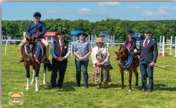
Showing Supreme Champion and Reserve Supreme Champion 2024

OFFICIAL MEASURER AND VETERINARY SURGEON Armour Veterinary Group, 5 High Street, Mauchline